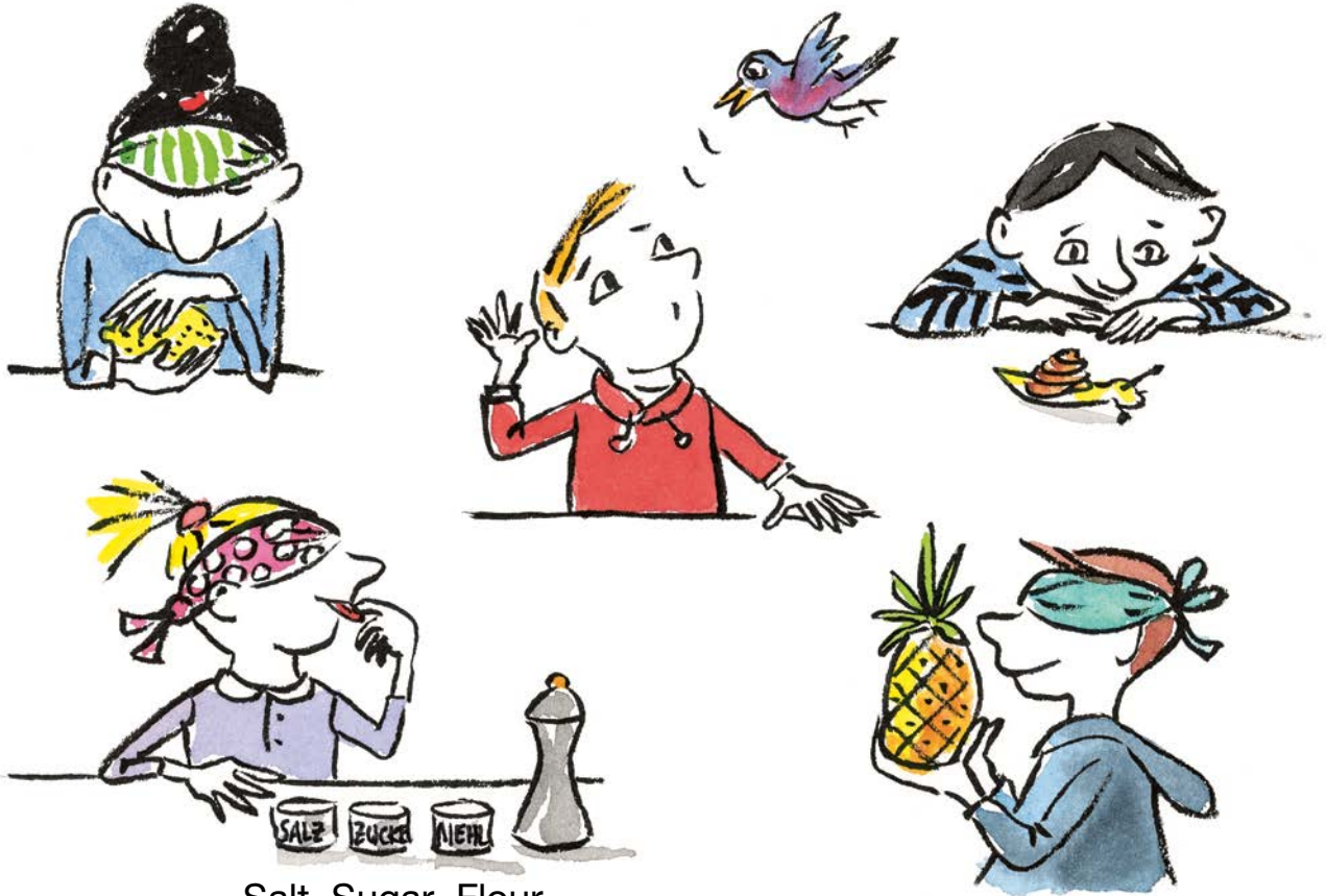
Salt Sugar Flour